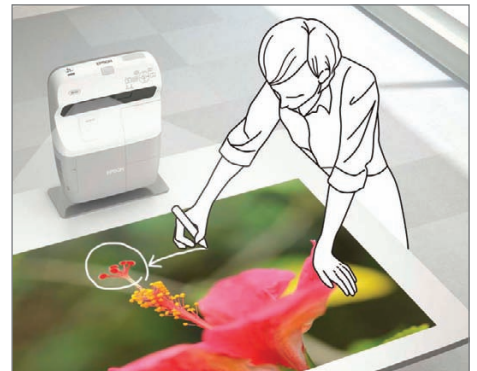
Project onto any horizontal surface such as a tabletop